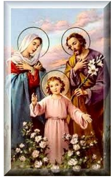
The Holy Family, Jesus, Mary & Joseph