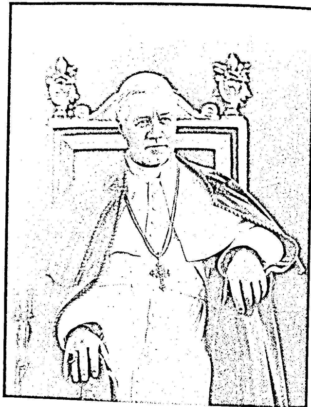
Pope St. Pius X 1835-1914 Occupied the Chair of Peter 1903-1914