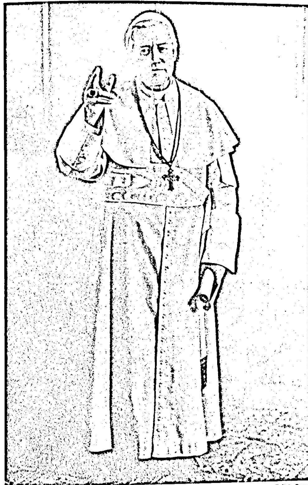
A photograph of Pope Pius X from the earliest days of his reign, showing the sadness so often evident on his face after his election to the pontificate.